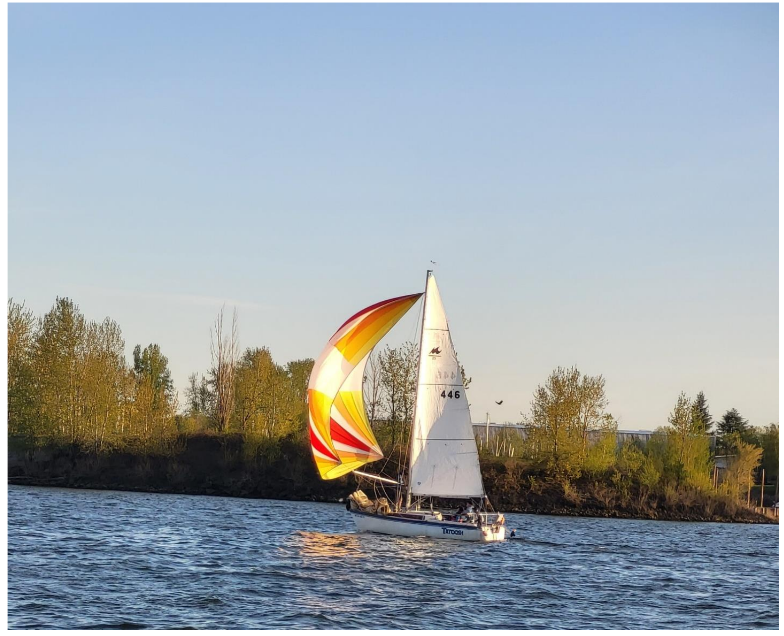
April 25 Race, Perfect weather