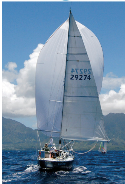
RainDrop at the finish line.