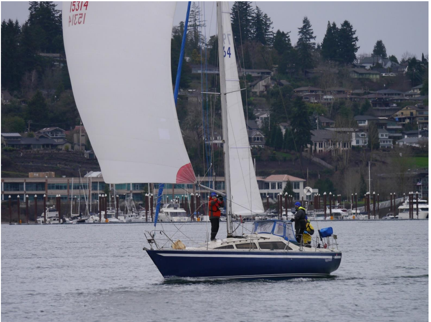
S.O.S. February 1