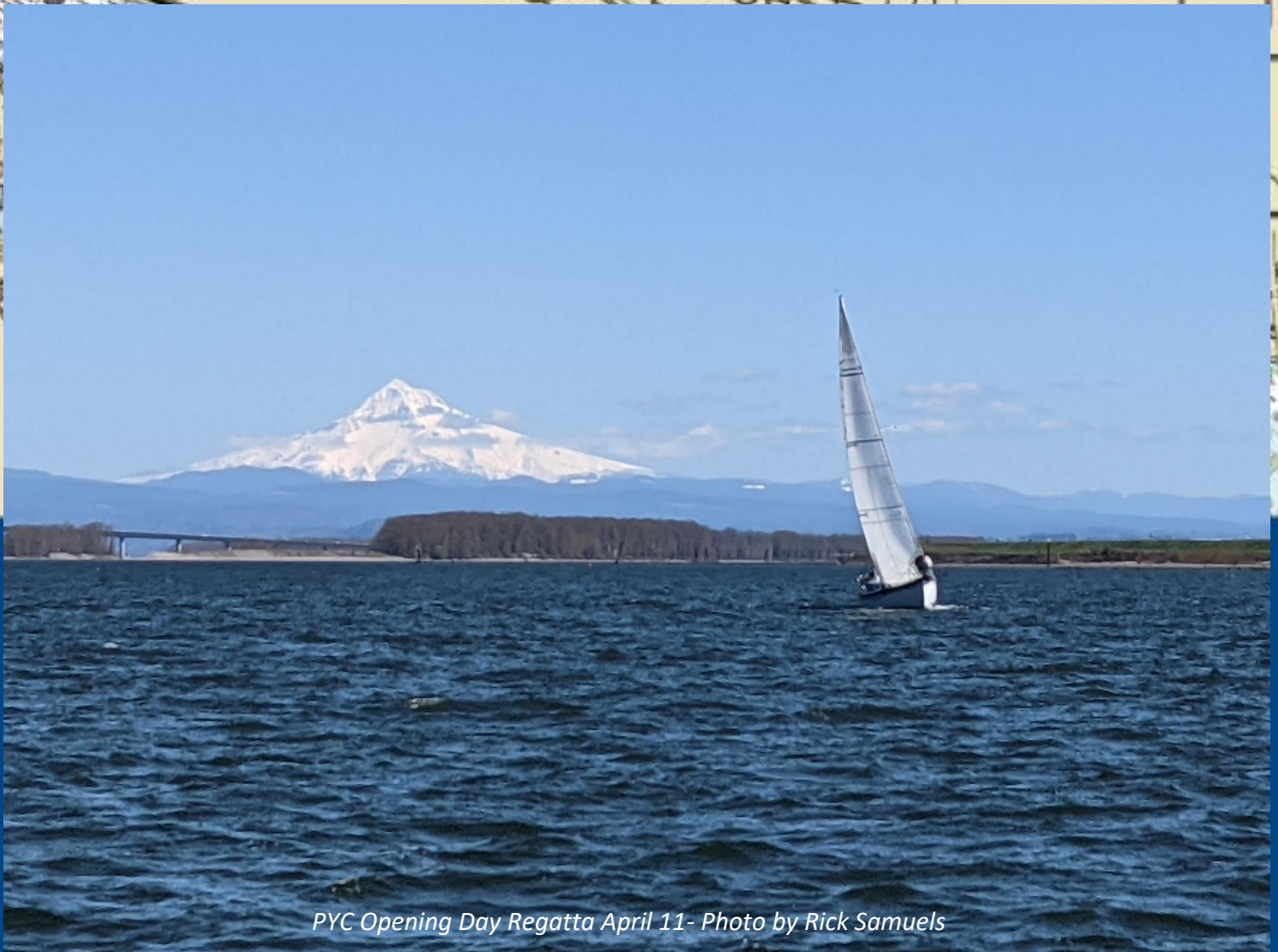
PYC Opening Day Regatta April 11