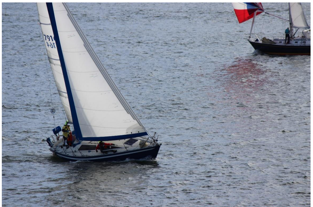
S.O.S. February 8