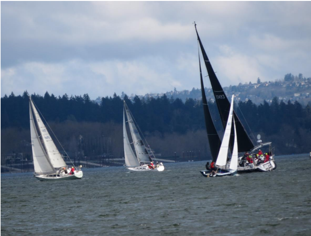
S.O.S. March 7

When I first started racing, I raced with a former collegiate sailor who told me that one of his warmups on race days was to drive to the regatta without using his brakes. Yep. He told me that, irrespective of how well he did in the process given that he didn't want to have an accident, the mental shift of being in a moving vehicle with cars moving around him without means to control pace by using the brake got him in the right mental mode for sailing in tight quarters during a start because, well, sailboats also don't have brakes. I never confirmed that he actually drove this way to a race for obvious reasons, but even 30 years later I do actually