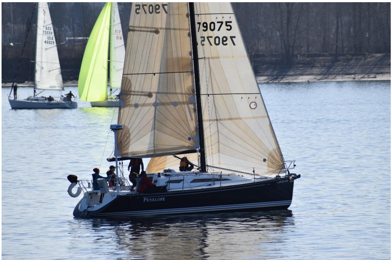
S.O.S. February 28

World Sailing - WS published the new four-year rule book this past January for 2021-2024. The PDF to the rules is linked here . Appendix C, includes all the changes to the regular rules starts on page 77 for MR. For instance, the definition of Zone is changed to two hull lengths. You may also want to page through the MR Call Book at some point, here is the link