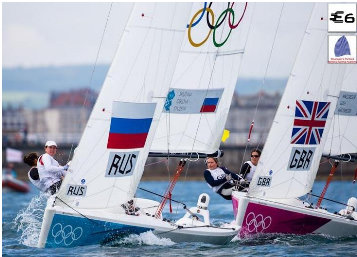
London 2012 Olympic Women's Keelboat Match Racing in small Elliot 6m keelboats with crew of three.

The SYSKO Racing Committee and Board have scheduled two online Match Racing seminars in May and three on the water events in July. The entire intent is for these to be informal and educational in nature. We have gathered some great materials for the seminars and have plans to run some fun events during Saturdays in July.