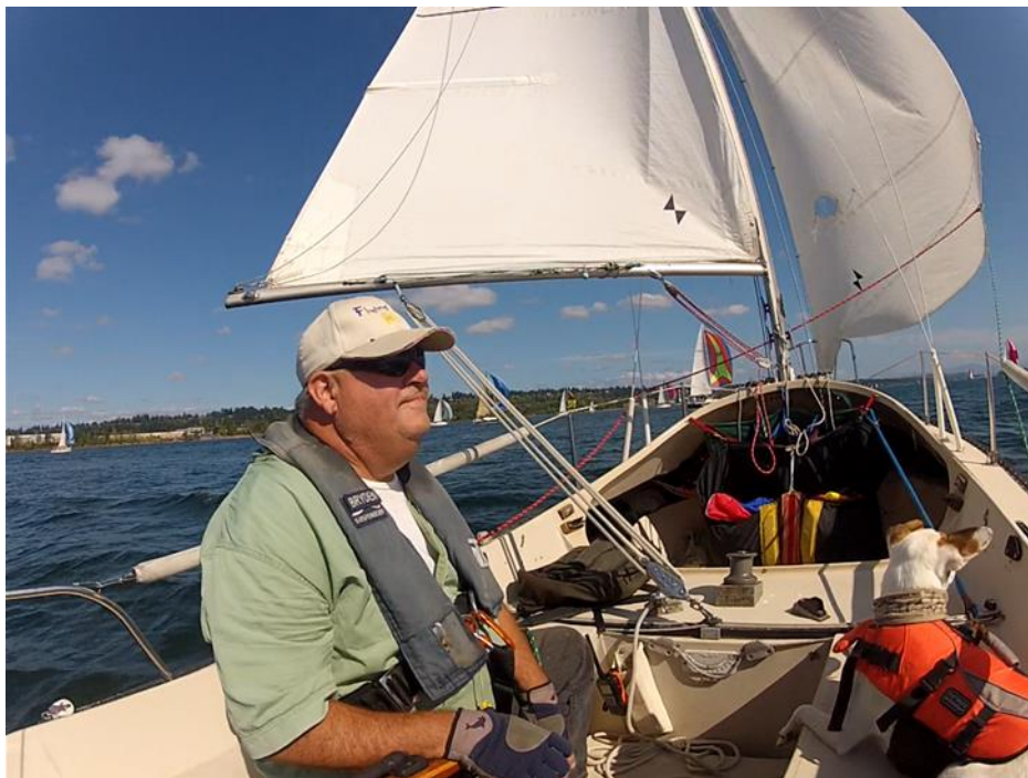
Frog and Tucker dog watch the Sailing on Sunday racers sail by.

While this has been a tough year in so many ways, I have to count my blessings: Being part of a great sailing community that comes together to keep our sport safe and alive. The committed efforts of our Board members who provide the perspective and energy to help us “keep calm and carry on.” The sheer joy of just going out for a sail on a day when you can see the sky and breathe. Watching new traditions like last week’s highly successful one-design match racing take hold.