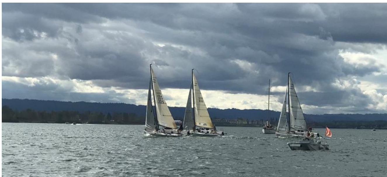
Start of the Melges fleet in the One-Design Regatta series