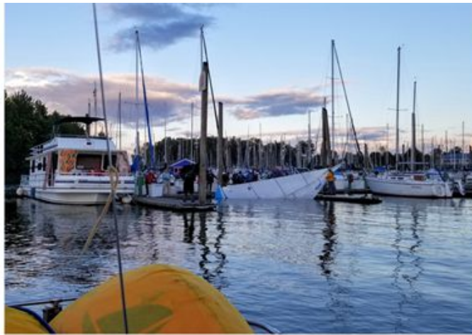
Surprise knockdown of a Venture 21... Pancho to the rescue, shadowed by the Sheriff and Fire boat.