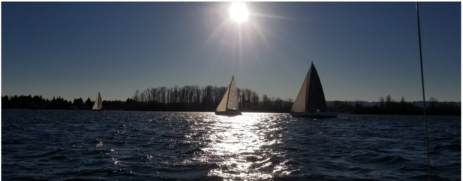
Finish line beat after the wind lightened up on the Jan 13 Sailing on Sunday race.