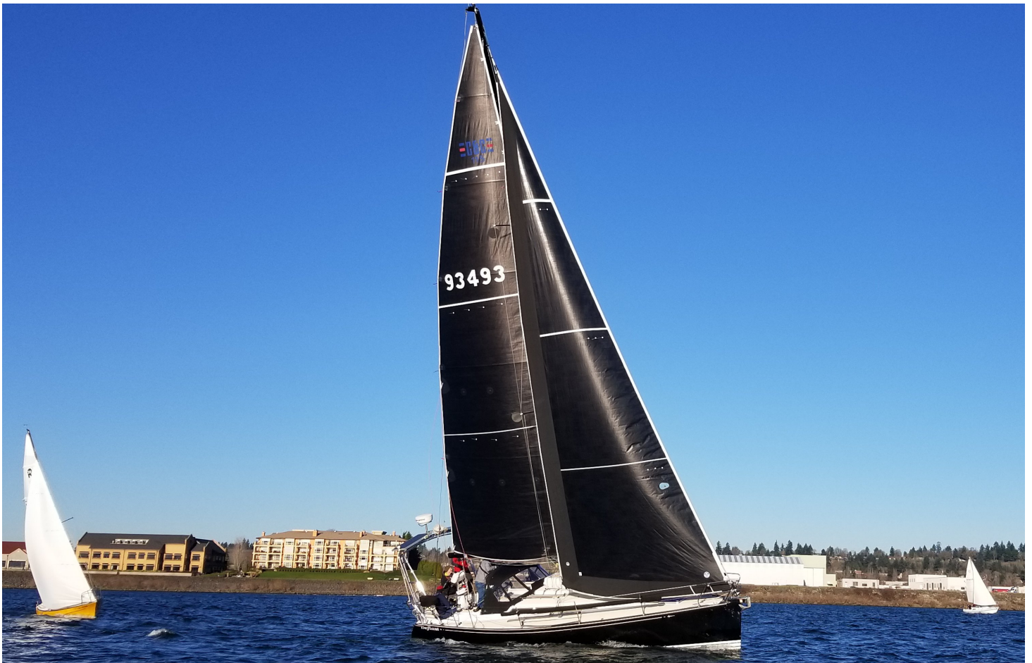
Defiant making a move on the finish line for the Jan 13 Sailing on Sunday race.

Please support this effort and register your boat for this event. Please contact me with any questions or suggestions at bruce97212@gmail.com .