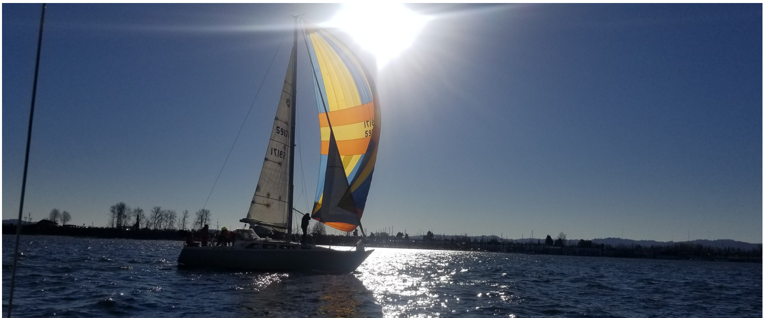
Cando on a spin run during on the Jan 13 Sailing on Sunday.

Thank you SYSCO Members for your faith and support. With your help, I'm sure this will be another season of excellent race events. I welcome your comments and feedback-- feel free to contact me at race_captain@syscosailing.org .