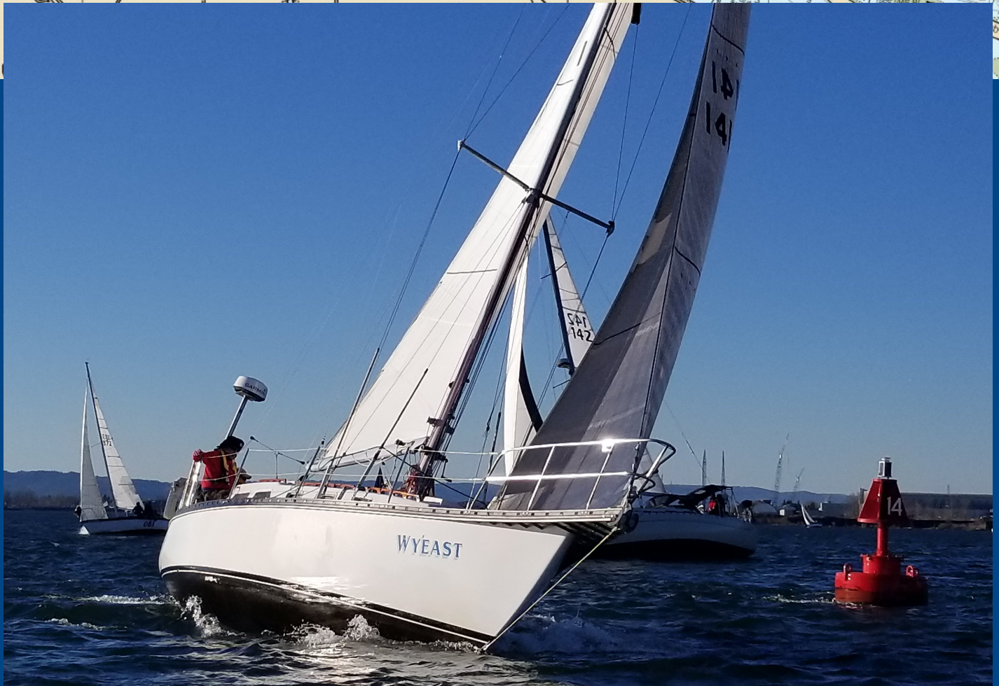
Wy'east crossing the finish line on a sunny Sailing on Sunday Jan 13, 2019.