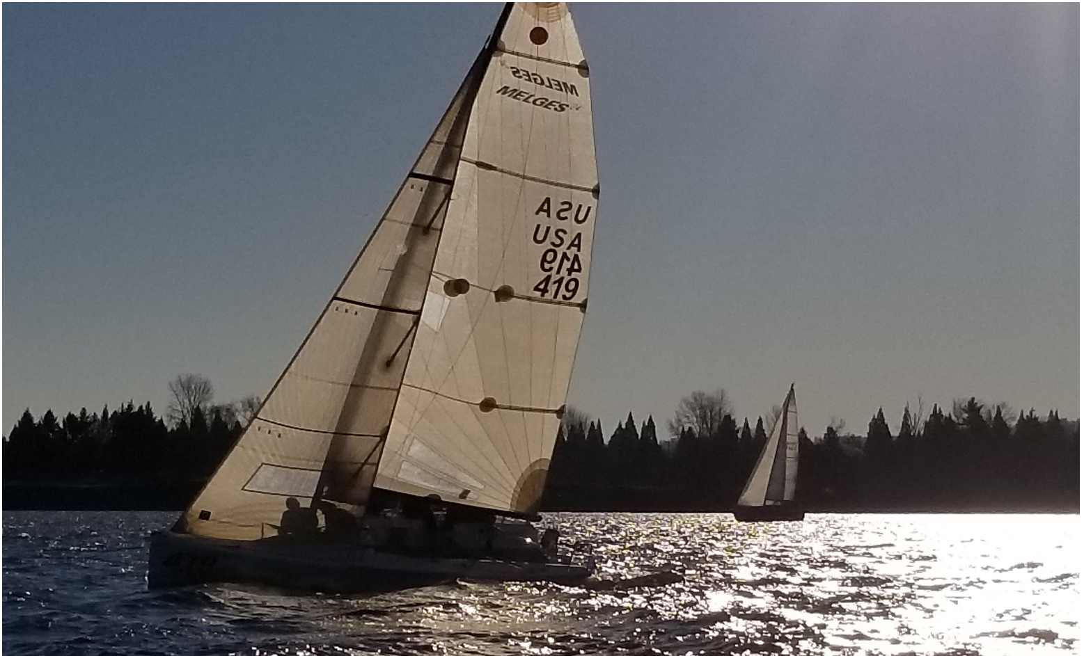
Apex making their way to the finish line on Sailing on Sunday on Jan 13.

Adjournment: The meeting was adjourned at 8:15 pm.