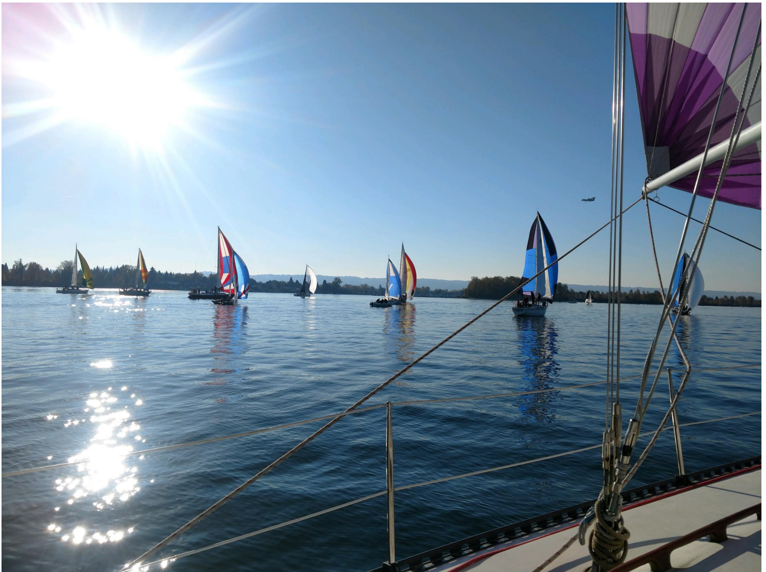
Another surprisingly sunny Sailing on Sunday race on Nov 18.