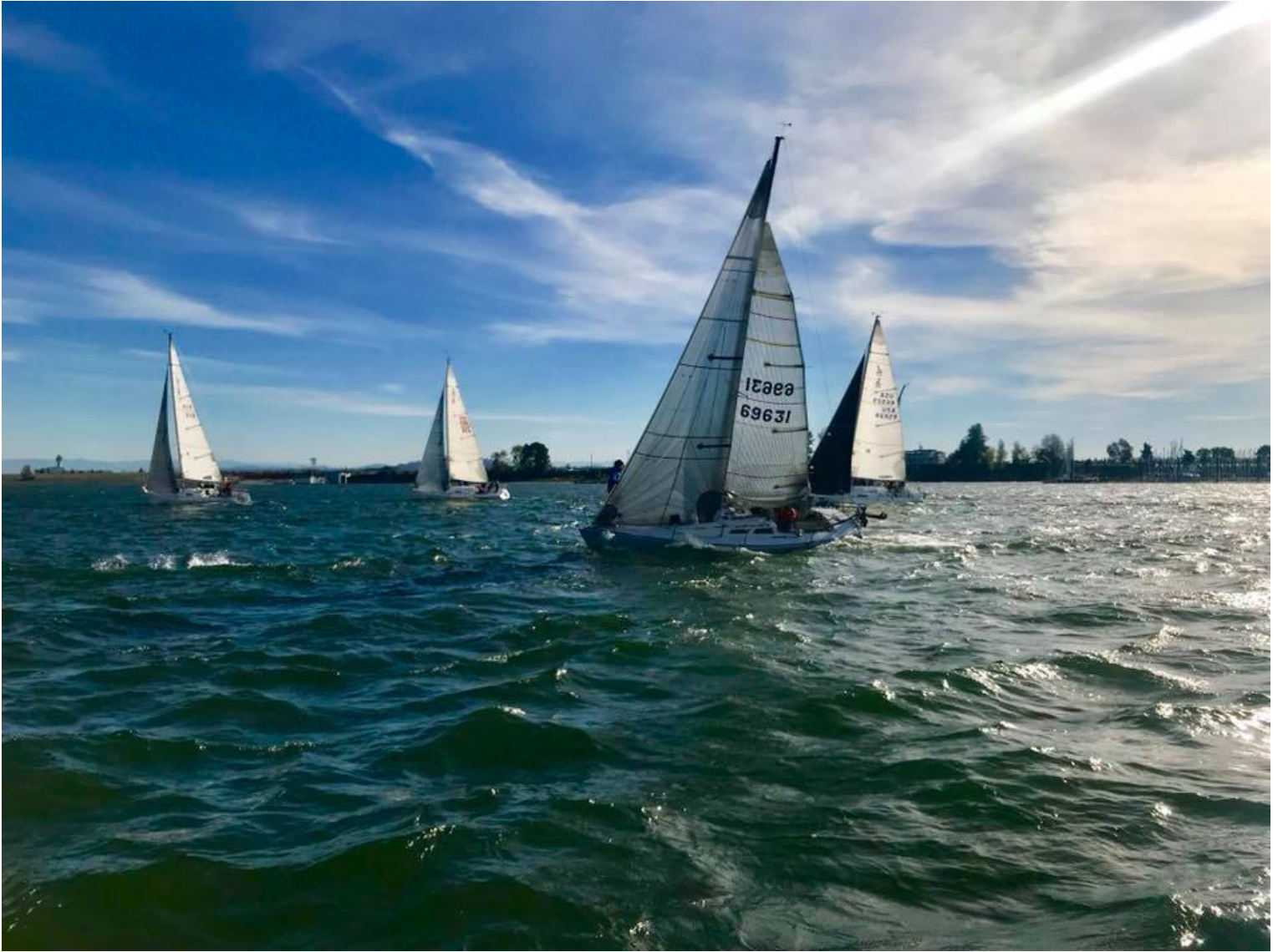
A windier Sailing on Sunday on Nov 11!

Thanks for all the help and see you on the water.