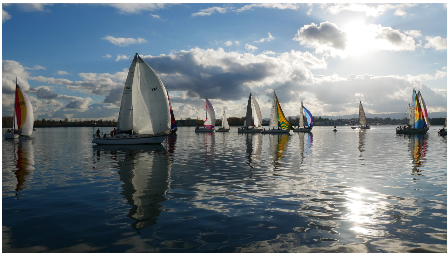
Colorful spinnakers struggling to stay full on this Dec 2 Sailing on Sunday race!