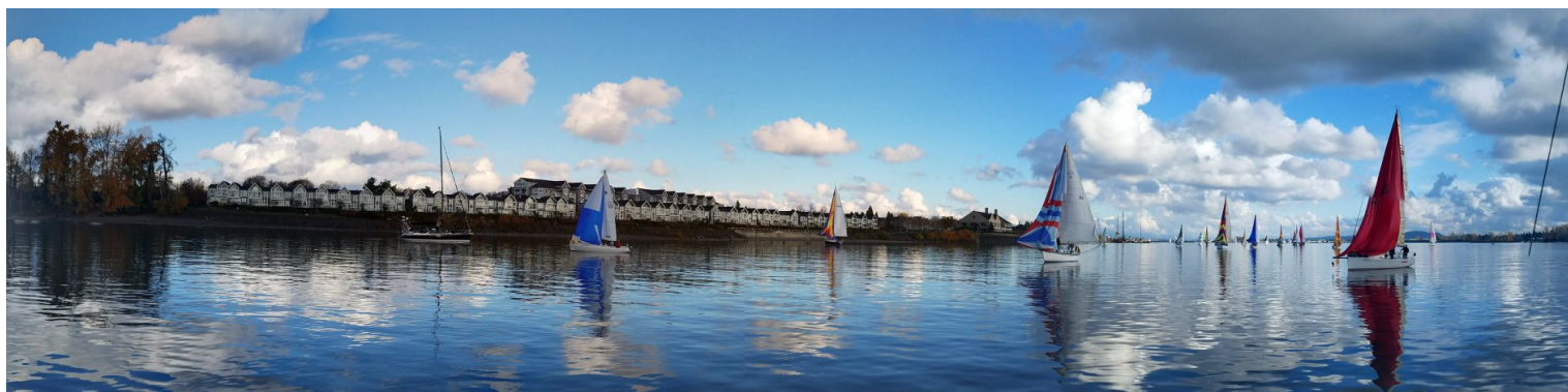
A panoramic view of the Nov 11th Sailing on Sunday race.

Working together we can grow the sport and ensure that racing on the mighty Columbia continues.