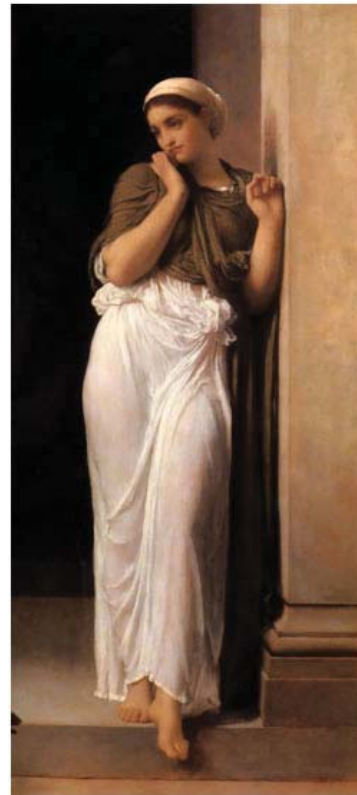
Nausicaä , Frederic Leighton, 1878.