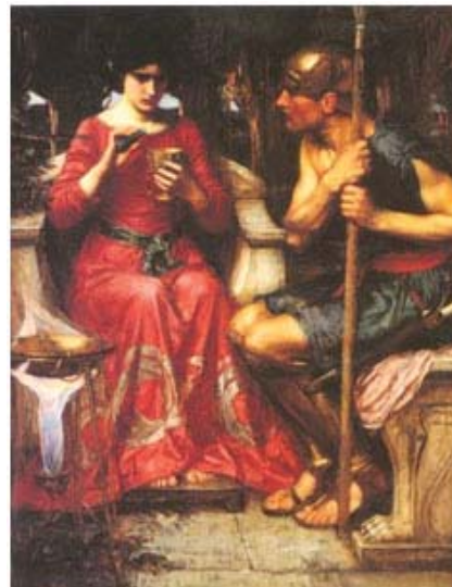
Medea prepares a potion for her philandering husband Jason. John William Waterhouse, 1907.

Whatever the case, mariners are often more sensitive than most to the thin veil that separates the material world from the numinous. Deep down, all sailors are animists, dimly aware that some “inanimate” objects, most especially the boats that bear us over the watery abyss, are not just clumps of atoms, but living beings with souls. Because we are but poor, simple men, we tend to feminamorphize the souls of our boats, a cool word I just made up that means, as used here: “the act of investing beloved curvaceous objects with the numinous characteristics of beloved curvaceous persons of the female persuasion.” In other words,