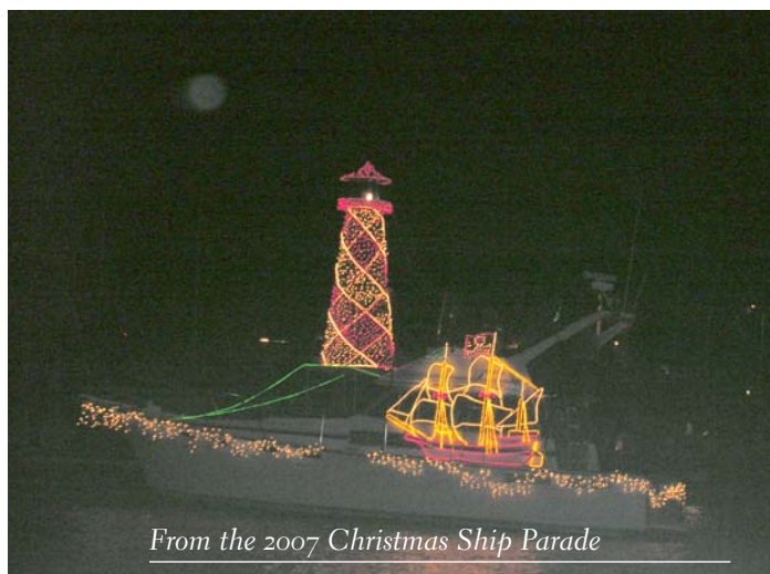
From the 2007 Christmas Ship Parade