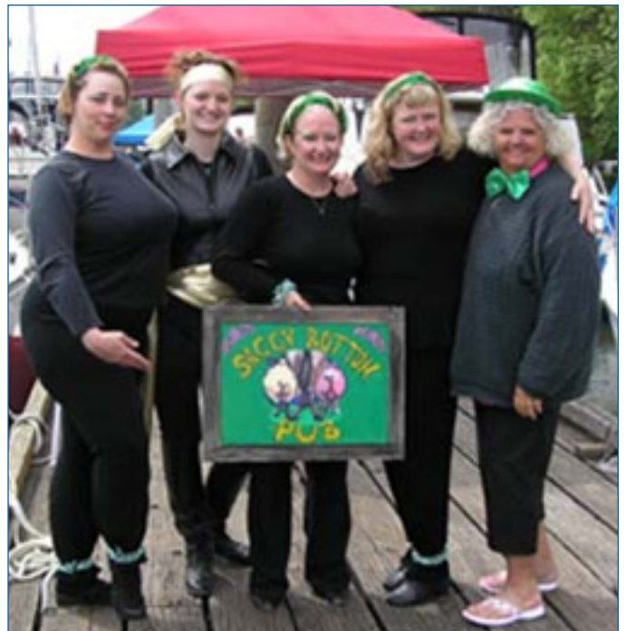
Ladies Cruise 2006